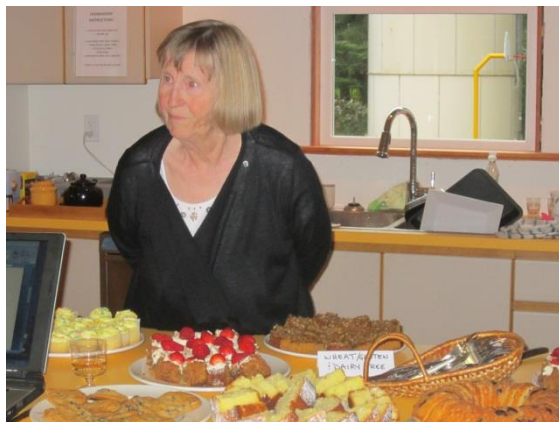
Seniors Help Bake & Garden