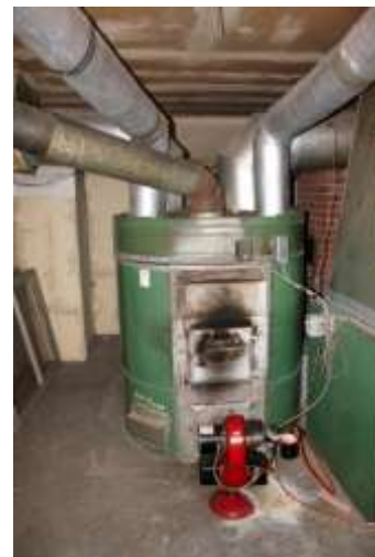
The Octopus. Originally a wood boiler, later converted to oil.

After many decades of keeping children warm, the old "Octopus" oil furnace is being replaced with a clean, efficient, heating system. And not a minute too soon! The old beast proved to be very costly last winter, operating at less than 20% efficiency and burning through the community's hard-earned funds like wildfire while occupants continued to shiver! CSAA is ecstatic to be the first local non-profit organization to receive a portion of the CVRD's "gas tax" funding.